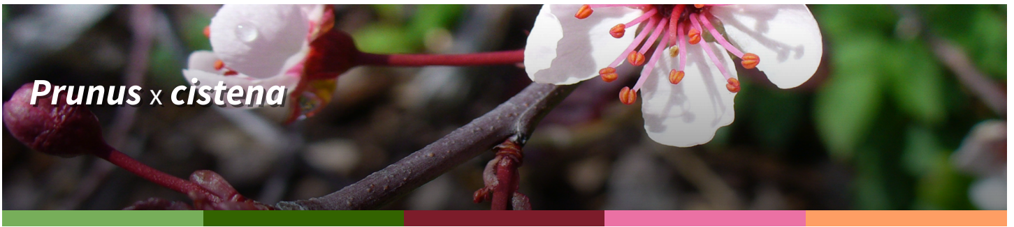
Prunus x cistena